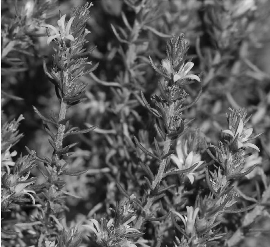
FIGURE 4.— Wahlenbergia suffruticosa , inflorescences.

car, expressed doubt on the validity of many of them. The most recent comprehensive revision of Lightfootia was published by Adamson (1955) in which he recognized 46 species and followed to a great extent the subgeneric treatment of Von Brehmer (1915). Since Adamson's treatment, new species and subspecies of the genus formerly treated as Lightfootia have been described for tropical Africa (Lambinon & Duvigneaud 1961; Duvigneaud & Denaeyer-De Smet 1963; Wild 1964) but none for South Africa.