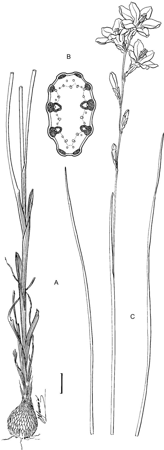
FIGURE 3.— Ixia teretifolia , Goldblatt & Manning 13671 (NBG). A, portion of flowering plant; B, T/S leaf blade; C, leaves and flowering stem. Scale bar: A–C, 10 mm; B, 1 mm. Artist: J.C. Manning.